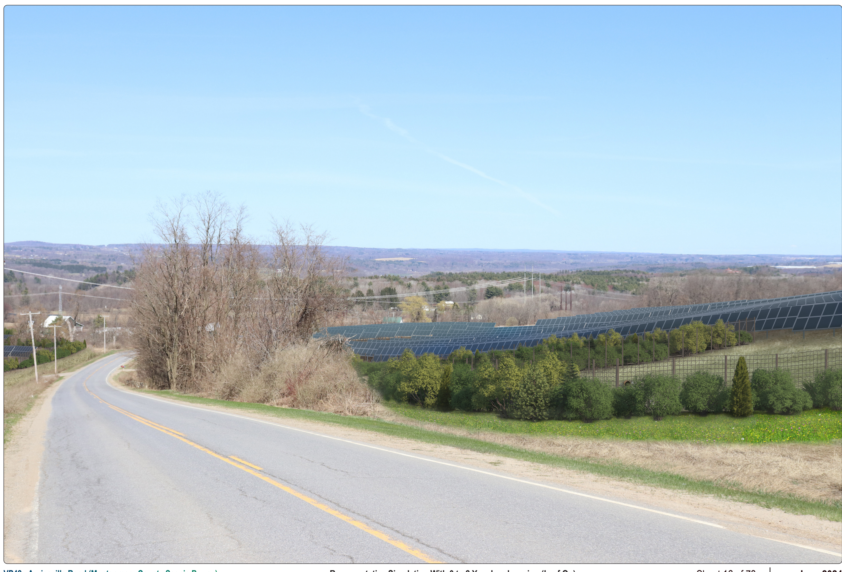
VP42 - Auriesville Road (Montgomery County Scenic Byway)