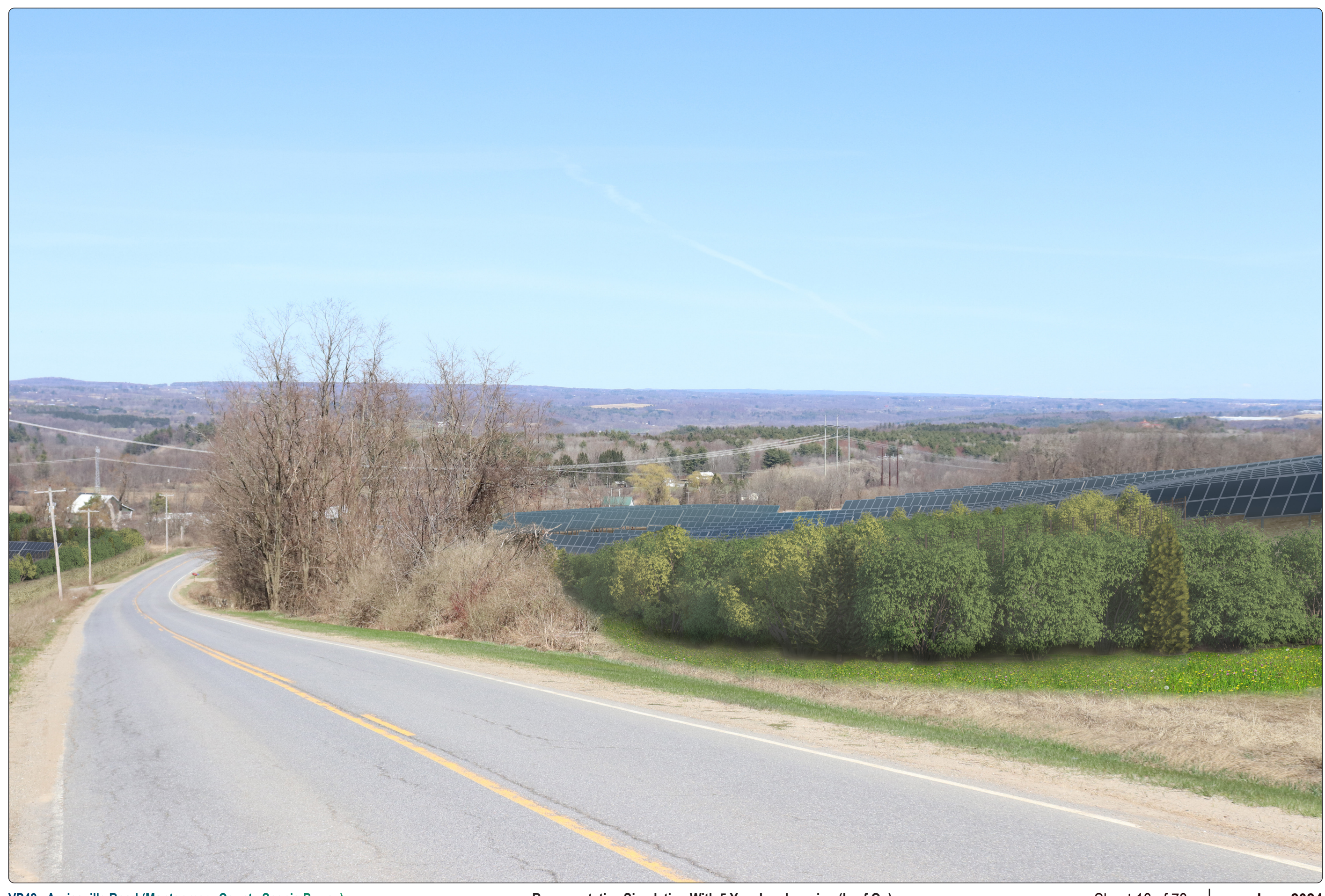
VP42 - Auriesville Road (Montgomery County Scenic Byway)