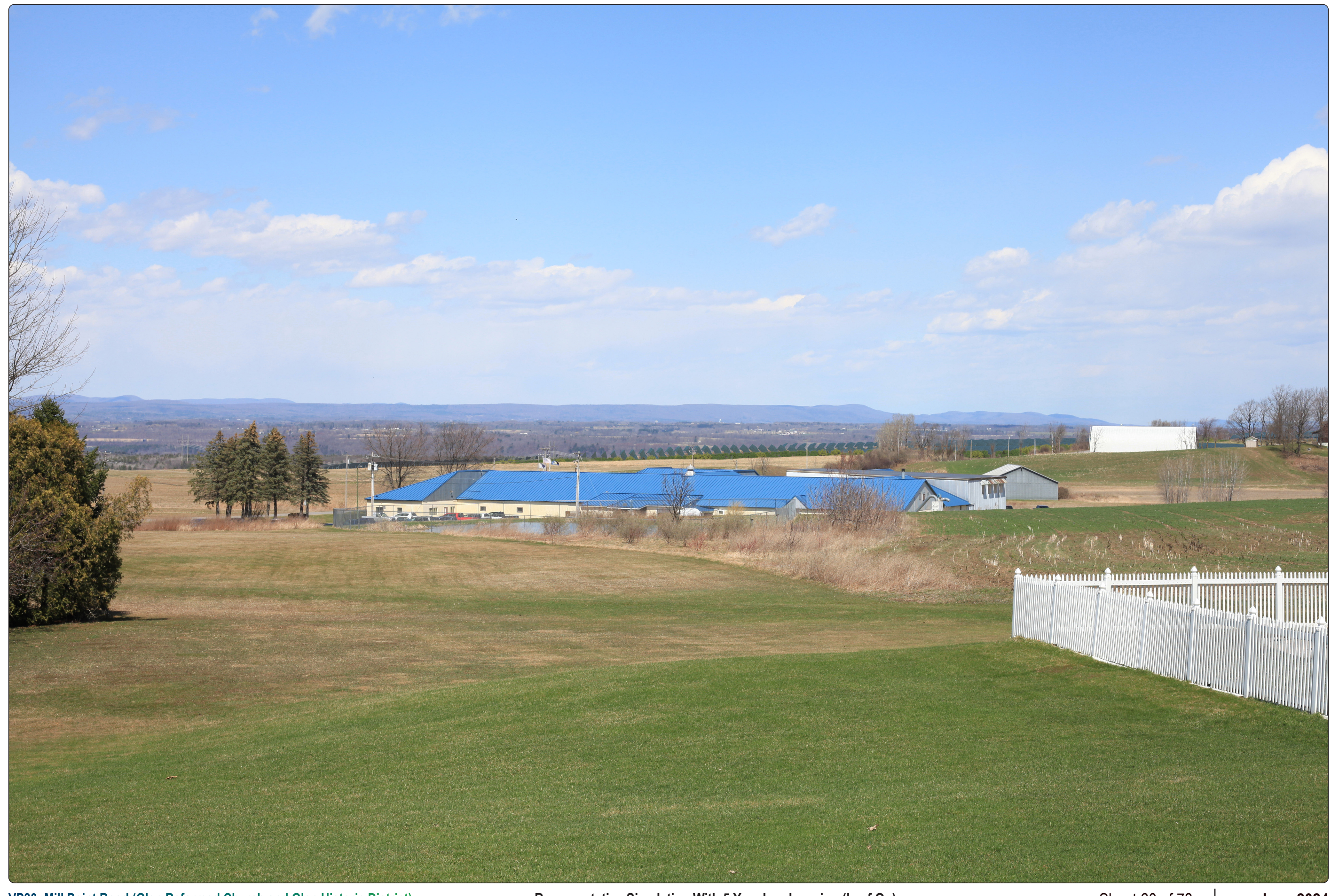
VP80 -Mill Point Road (Glen Reformed Church and Glen Historic District)